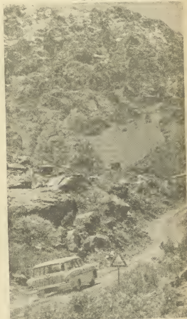
The sun-baked Chevrolet pairs past a road sign that says "danger" — and ahead lies the roughest part of the pantheon Andean climb!

See your local authorized Chevrolet dealer for quick appraisal—prompt delivery!